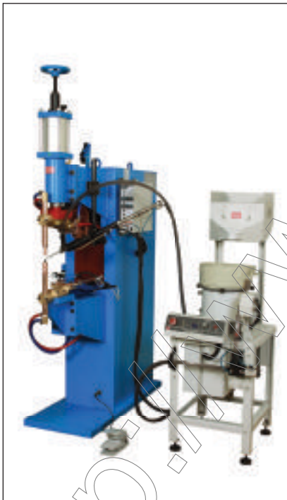
100 KVA Standard Series Spot Welder with NASH Nut Feeder