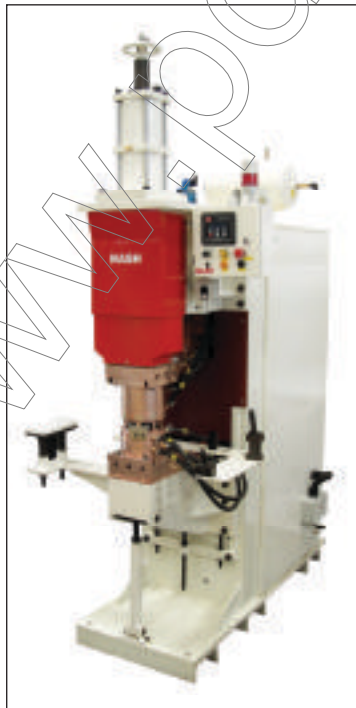
300 KVA MFDC Projection Welder