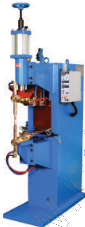
75 KVA Standard Series Spot Welder