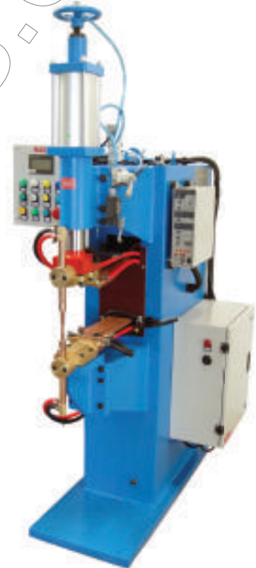
100 KVA Standard Series Spot Welder with PLC Controller