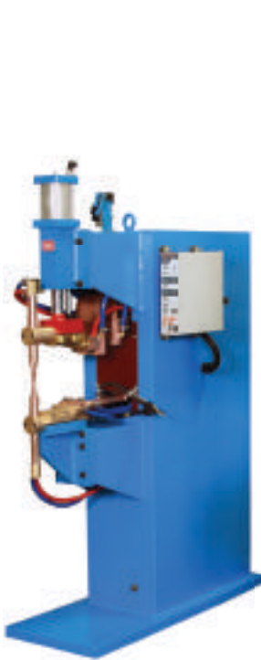
50 KVA Standard Series Spot Welder